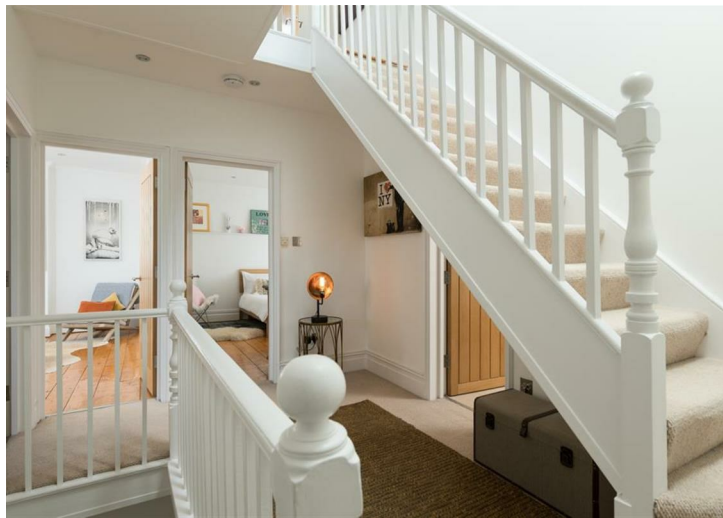
Ground Floor First Floor Second Floor